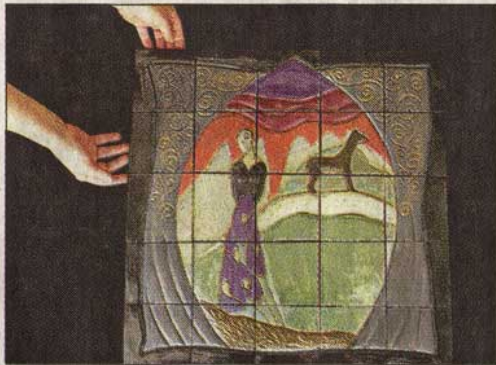
Marina Bosetti's recently finished 'Purple Sun' will be on display at Seven Sisters Gallery in Black Mountain on Aug. 1.

"I've broken it down into three things," she